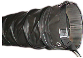
Ventilation pipe supplied with slots and fastening strap