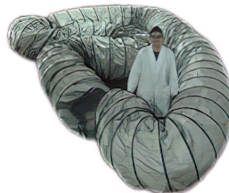
Ventilation pipe Ø 800 x 25 meters in a single piece