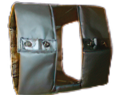
Thermal protection for steam battery

Tubi Flessibili Srl is an artisan company specialized in the production and marketing of industrial flexible hoses for special applications. Thanks to our many years of experience in the sector, we have come into contact with numerous companies looking for individual, unique, customized solutions. These experiences have allowed us to study, design and create multiple ad hoc solutions for each individual customer.