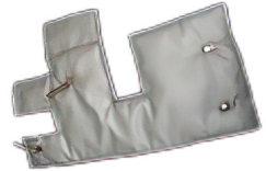
Thermal protection shaped for turbine