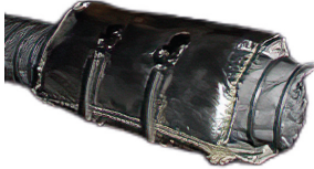
Thermal protection 400°C on metal pipe