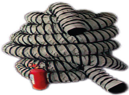
Aviation petrol vapour suction pipe Ø 203 x 50 metres in a single piece