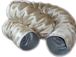
Hot air suction pipe (150°C) with external anti-spark protection