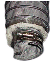
Insulated pipe for energy recovery