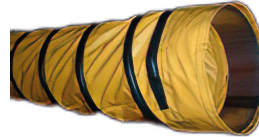
Ventilation pipe supplied with profile for anti-abrasive protection