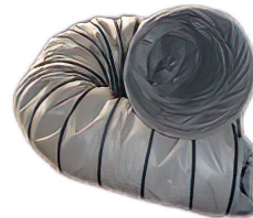
Insulated ventilation pipe Ø 700 x 6 meters in a single piece